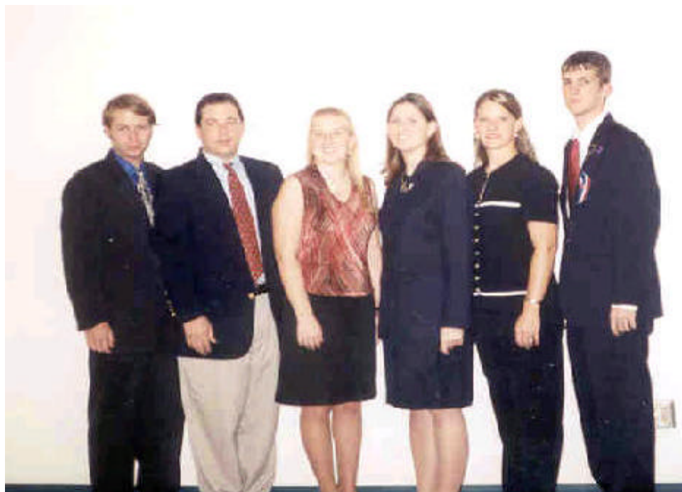
NCPBL State Officers