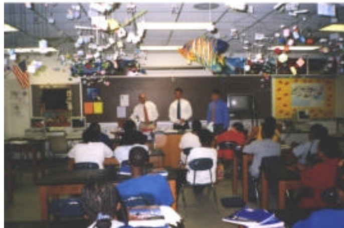
Connecting with FBLA students