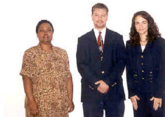
NCPBL Professional Division Officers