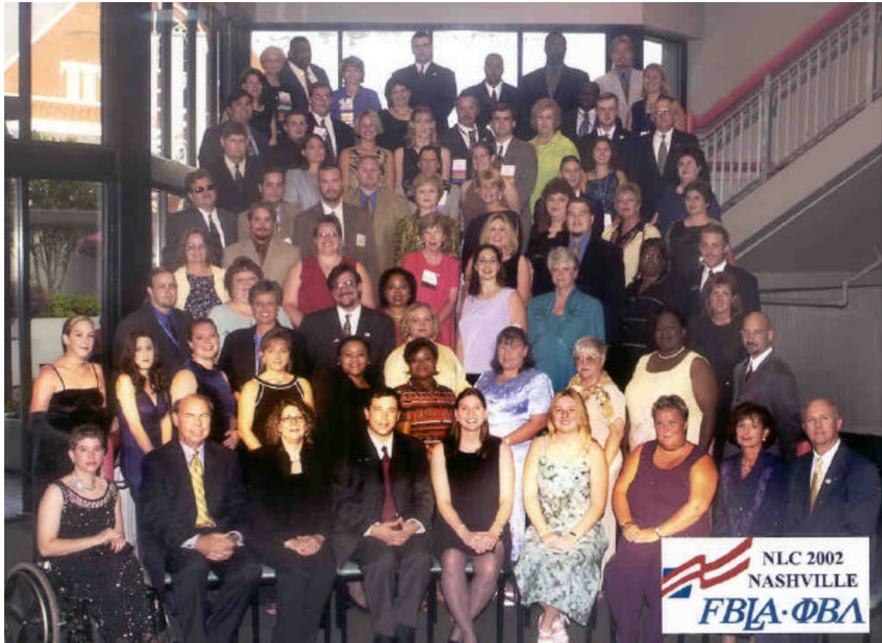
NCPBL Delegation in Nashville, Tennessee