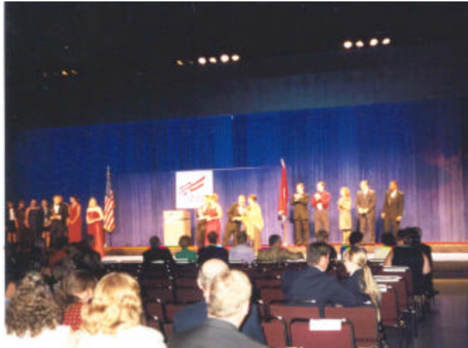
2002 NLC Nashville, Tennessee Awards Presentation