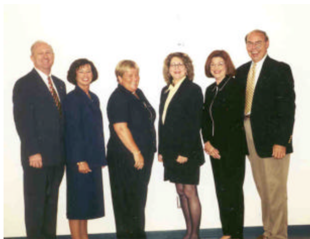
NCPBL State Committee Members