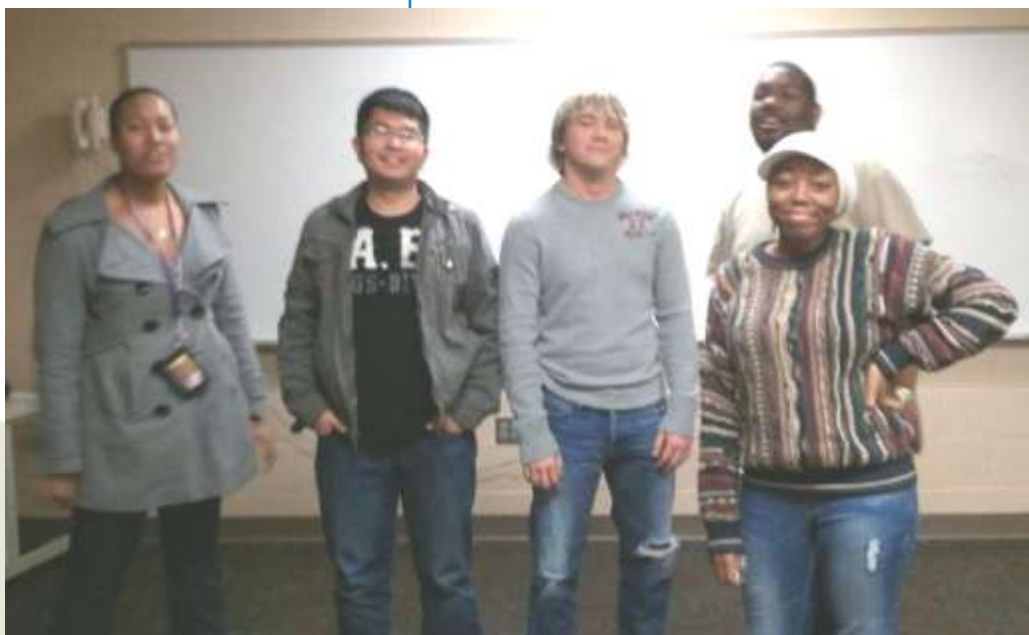
Right: Western Carolina officers enjoy their Spring 2011 Officer Retreat

The past six months have been an exciting time for the Delta Beta Upsilon chapter. Early in the fall, we held a planning session for our officers to solidify our goals for this year. We participated in Durham Tech's Fall Fest to promote the chapter and recruit new members. We hosted the Fall Kick-off in September, and have attended both the