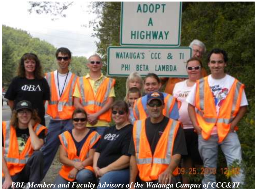
PBL Members and Faculty Advisors of the Watauga Campus of CCC&TI

As always, we look forward to networking with our NCPBL associates at various locations across the state.