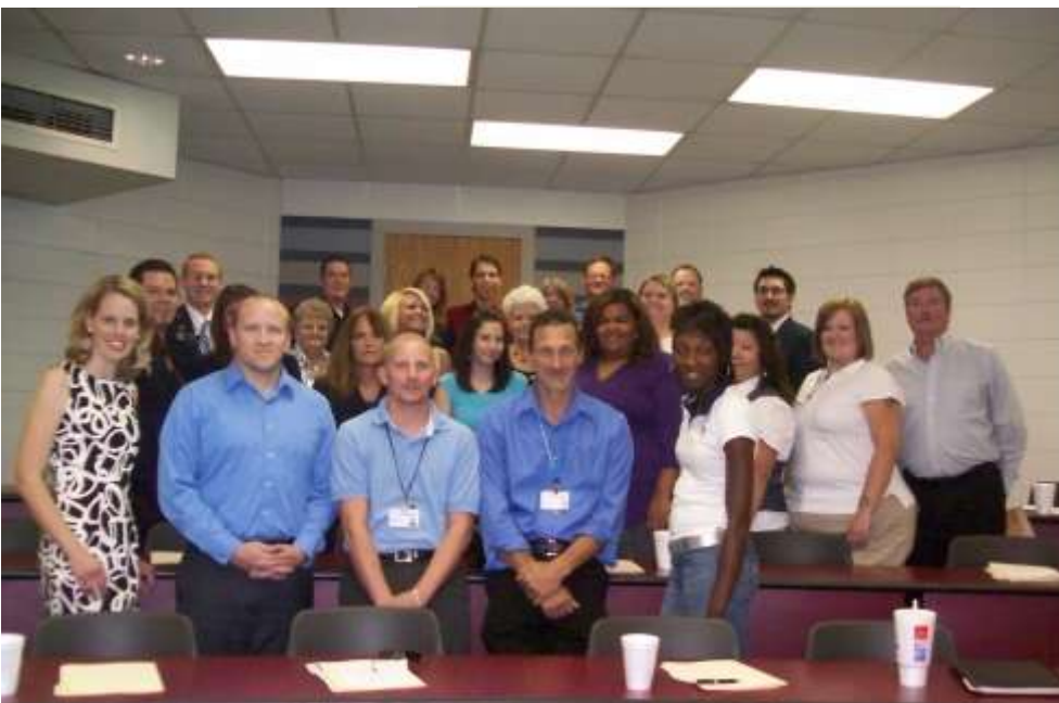
Group photo of members attending the Western Region Kick-Off meeting at Gaston College.