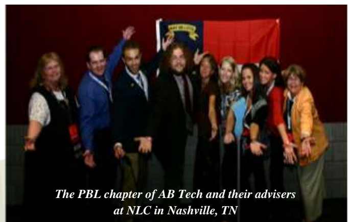
The PBL chapter of AB Tech and their advisers at NLC in Nashville, TN

Our annual awards banquet was held in July. Our chapter gathered for food, fellowship, and fun. During the banquet, awards were presented to mem-