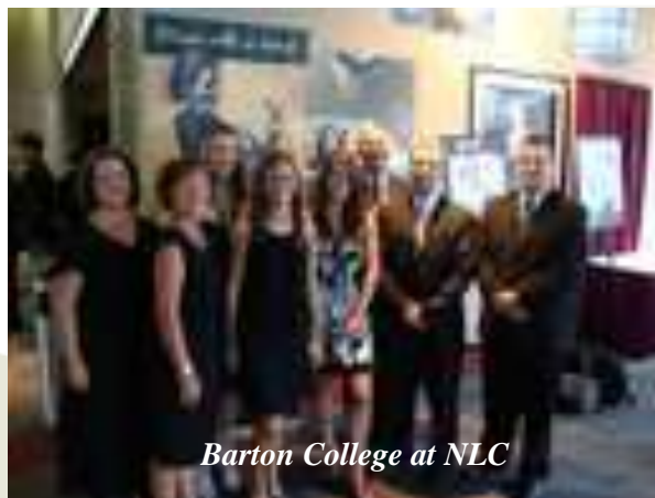
Barton College at NLC

Our chapter continues to blend the talents of both traditional and Weekend College students through joint projects as we continue 'Breaking Barriers!'