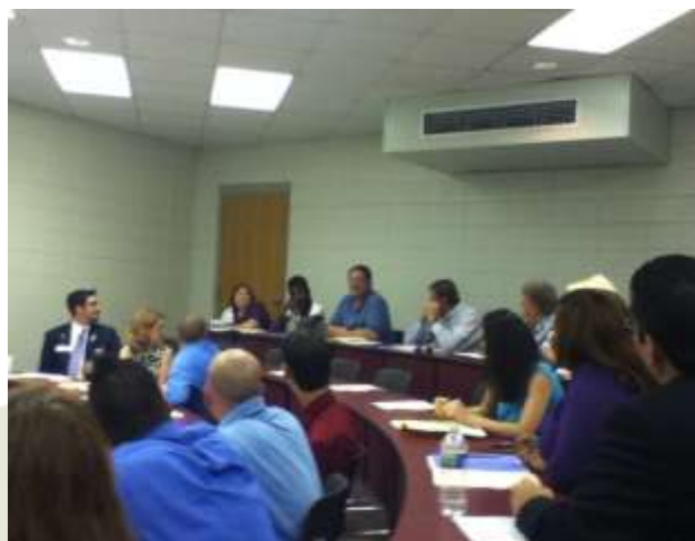
Chapter members hear how NCPBL is Breaking Barriers this year!