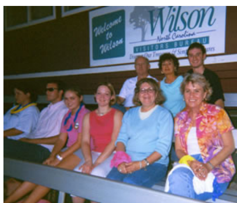
State Executive Council members enjoying a relaxing evening at the Wilson Tob's baseball game after a busy day!